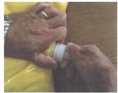
Pouch Preparation #5