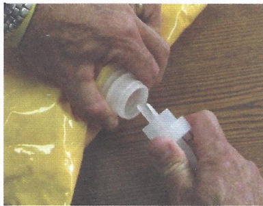
Pouch Preparation #3 & #4