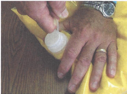
Pouch Preparation # 2